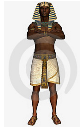
Image of an Egyptian Pharaoh

[Answer: Joseph was one of the original "children of Israel (Jacob)" who rejected Him out of envy. His father loved him greatly. He was obedient. His own people sold him (like Judas sold Jesus). He was taken to Egypt. He was falsely accused and put in prison. He rose to a position of power at the right hand of the king. In that position of power, he saved his brothers who had rejected Him. He revealed Himself in a glorious way at a great banquet.]