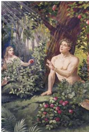
Adam disobeyed God when Satan tempted him.

Another kind of prophecy includes many Old Testament patterns that are fulfilled by Jesus . For example, Jesus is called the 'Final Adam' in 1 Corinthians 15:45, and there are several important likenesses and contrasts between Jesus and Adam in Romans 5:12–12 and 1 Corinthians 15:20–23, 45–50. Both Jesus and Adam were heads of a new human race, and both brought far-reaching results upon their race because of what they did.