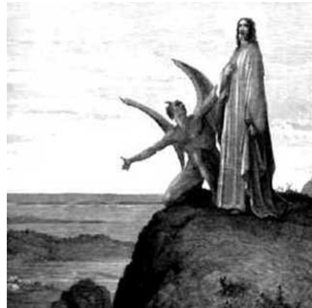
Jesus resisted when Satan tempted him.

For a special study (which will take a lot of well-spent time) we recommend discovering the many comparisons and contrasts between Jesus and the following people: