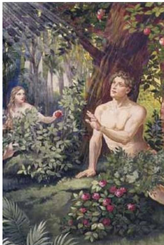
Adam disobeyed God when Satan tempted him.

Another kind of prophecy includes many Old Testament patterns that are fulfilled by Jesus . For example, Jesus is called the 'Final Adam' in 1 Corinthians 15:45, and there are several important likenesses and contrasts between Jesus and Adam in Romans 5:12-12 and 1 Corinthians 15:20-23, 45-50. Both Jesus and Adam were heads of a new human race, and both brought far-reaching results upon their race because of what they did.