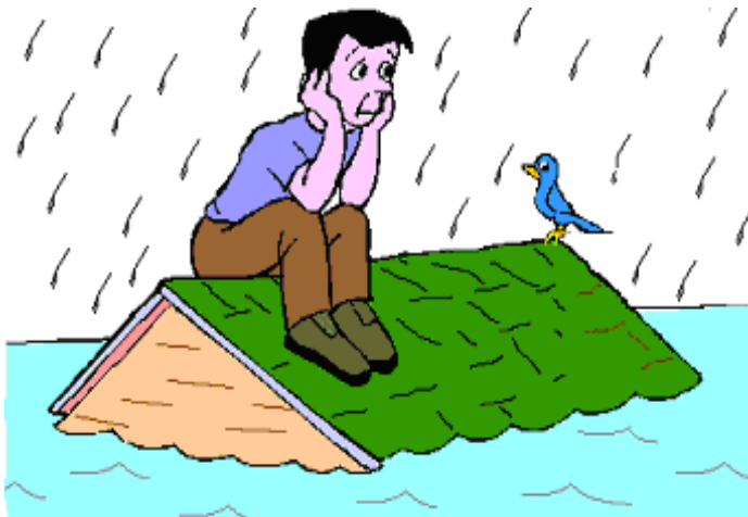
A man who built his house on sand