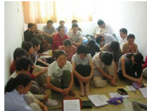
Missionaries prepare to go to neglected peoples

Those who teach children should read study #77 for children.