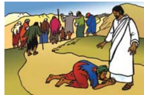
Jesus healed ten lepers. Only one of them returned to thank him.

Read the account about the ten lepers from Luke 10:11-19 .