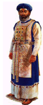
Jewish high priest